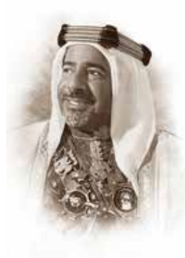
His Highness Sheikh Isa bin Salman Al Khalifa. Late Emir of Bahrain.