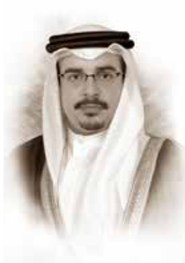
His Royal Highness Prince Salman bin Hamad Al Khalifa. Crown Prince & Prime Minister.