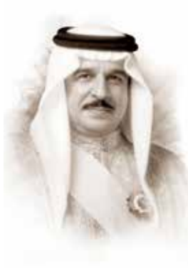
His Majesty King Hamad Bin Isa Al Khalifa, King of Bahrain.